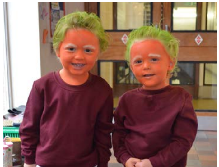
Our two Oompa Loompas, characters from Willy Wonka & the Chocolate Factory